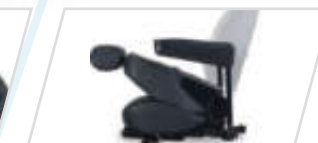
Leather liked cushion seat