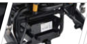
Convenient battery pack