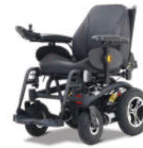
iPower GTS Plus