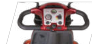
Clear control panel