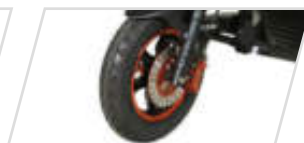
Tire size 16"x13"