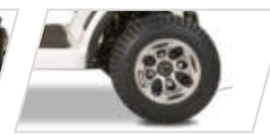
Tire size 12"x3.5"