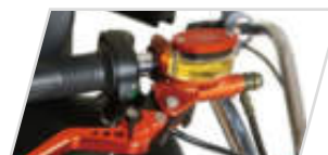
Handle bar with brake oil