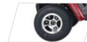
13" and 15" pneumatic tires