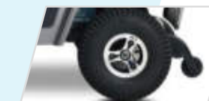
Tire size 10"x3.5"