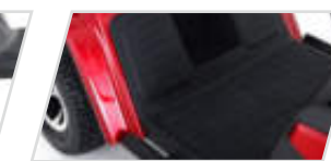
Exceptional large legroom