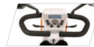
Clear and simple control panel