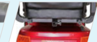
Reserved bolt for accessories