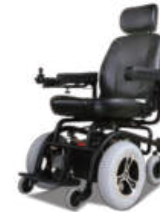
iPower Sport FWD