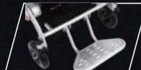
Large foot platform