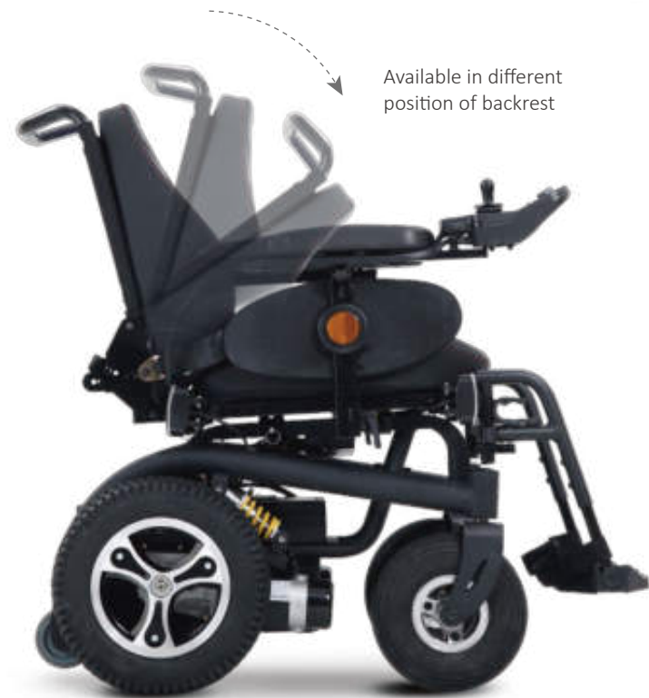
Available in different position of backrest