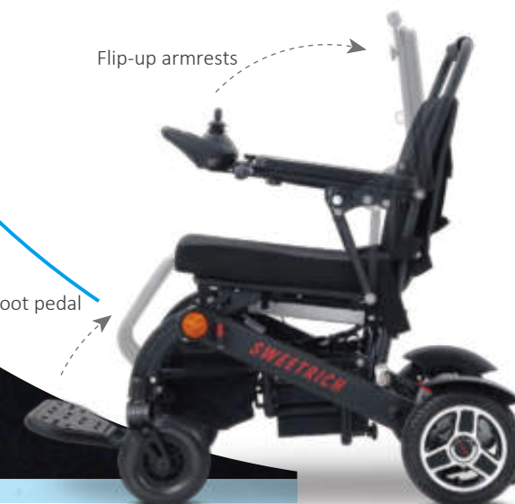
Flip-up foot pedal