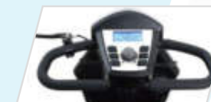
Clear control panel