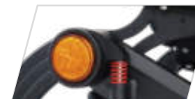
Signal light on each side