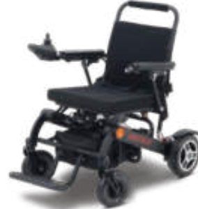
iFold / iFold Plus