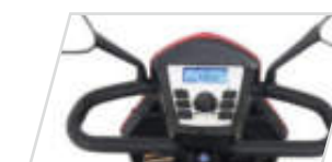
Clear control panel