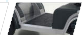
Large legrest room