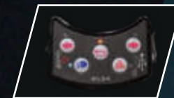
Optional light packages with Convenient USB charger port