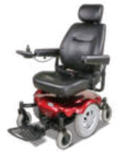
iPower Sport MWD